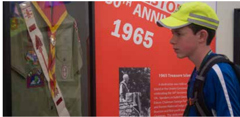
Youth looking at a framed 1960s Scout uniform.