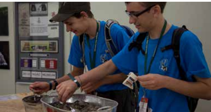
GEO participants mix souvenir soil from the Treasure Island and The Summit Bechtel Reserve.