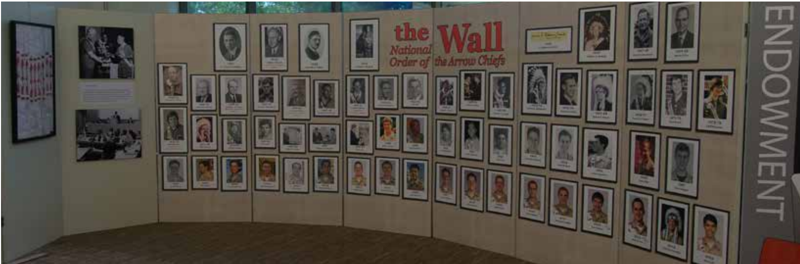
The Wall of National Order of the Arrow Chiefs. Pictures were signed by the former national chiefs in attendance.